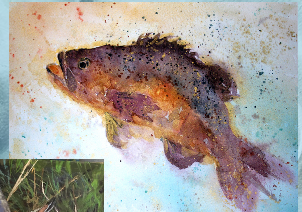
"Bass Up" by Catharine Moore