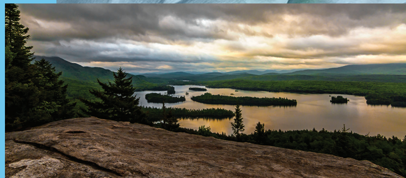
"Castle Rock"